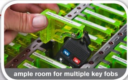
ample room for multiple key fobs